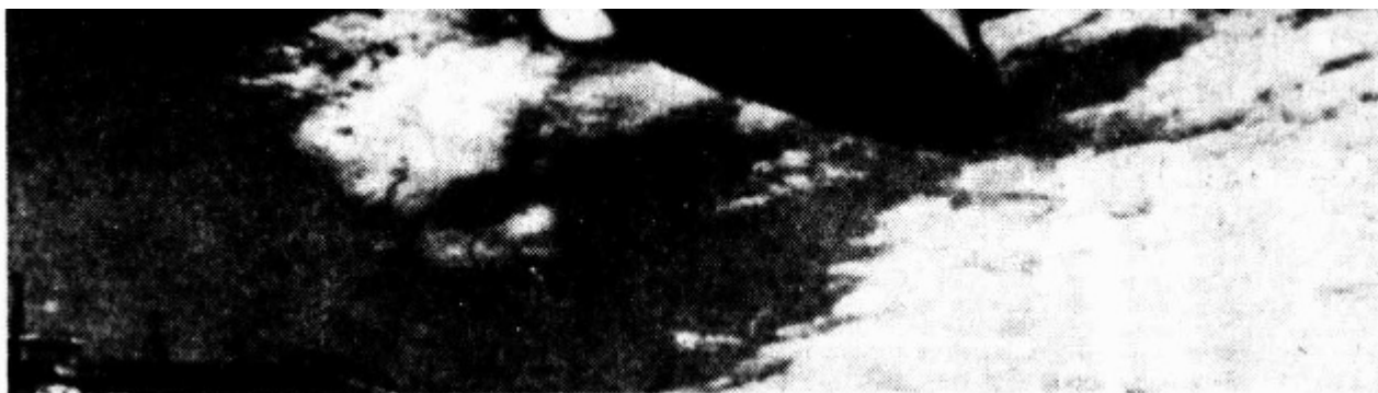
This mock-up by artists reproduces the details of the most commonly reported variety of flying saucer. The three spheres beneath it are described by observers who claim to have seen saucers on the ground, as undercarriage.

indications that at least two of the three objects found last May are much larger, and that they were in orbit perhaps for years before they were discovered.